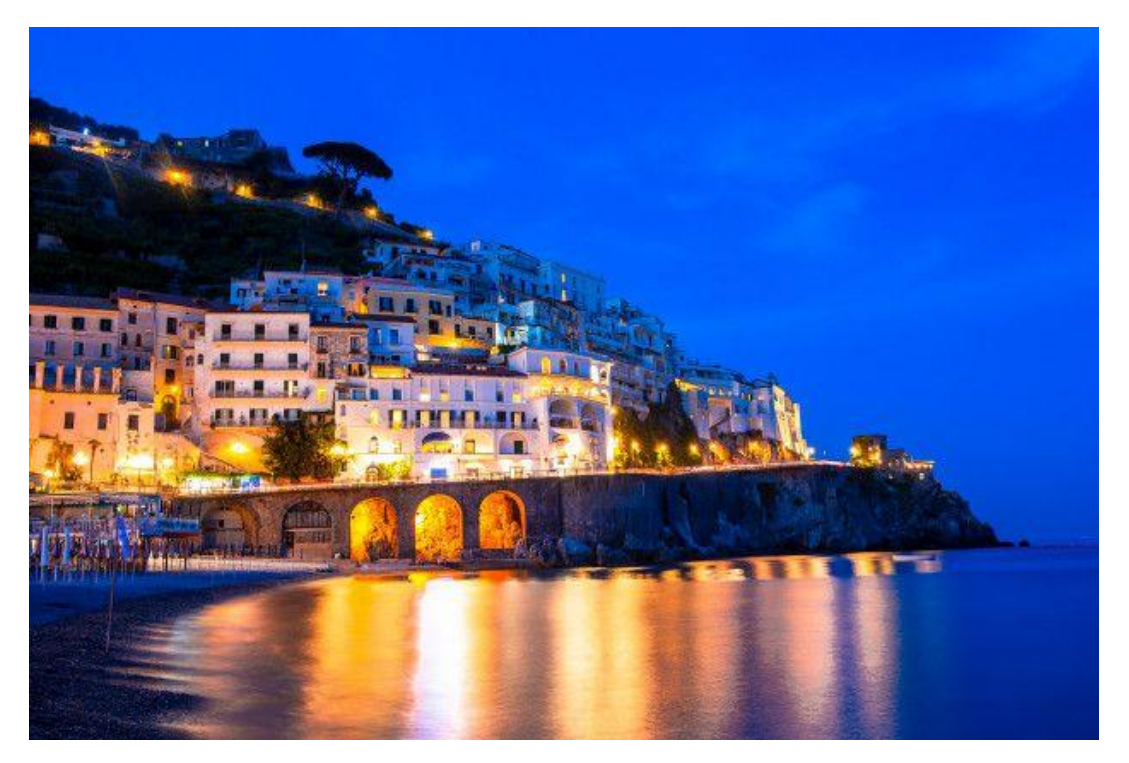
Amalfi Coast, Italy