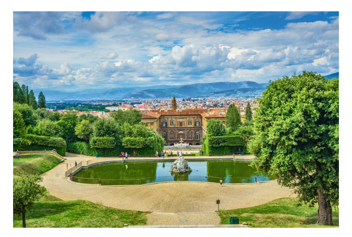
Bable garden, Florence, Italy