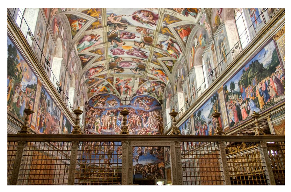
Vatican Museum, Rome, Italy