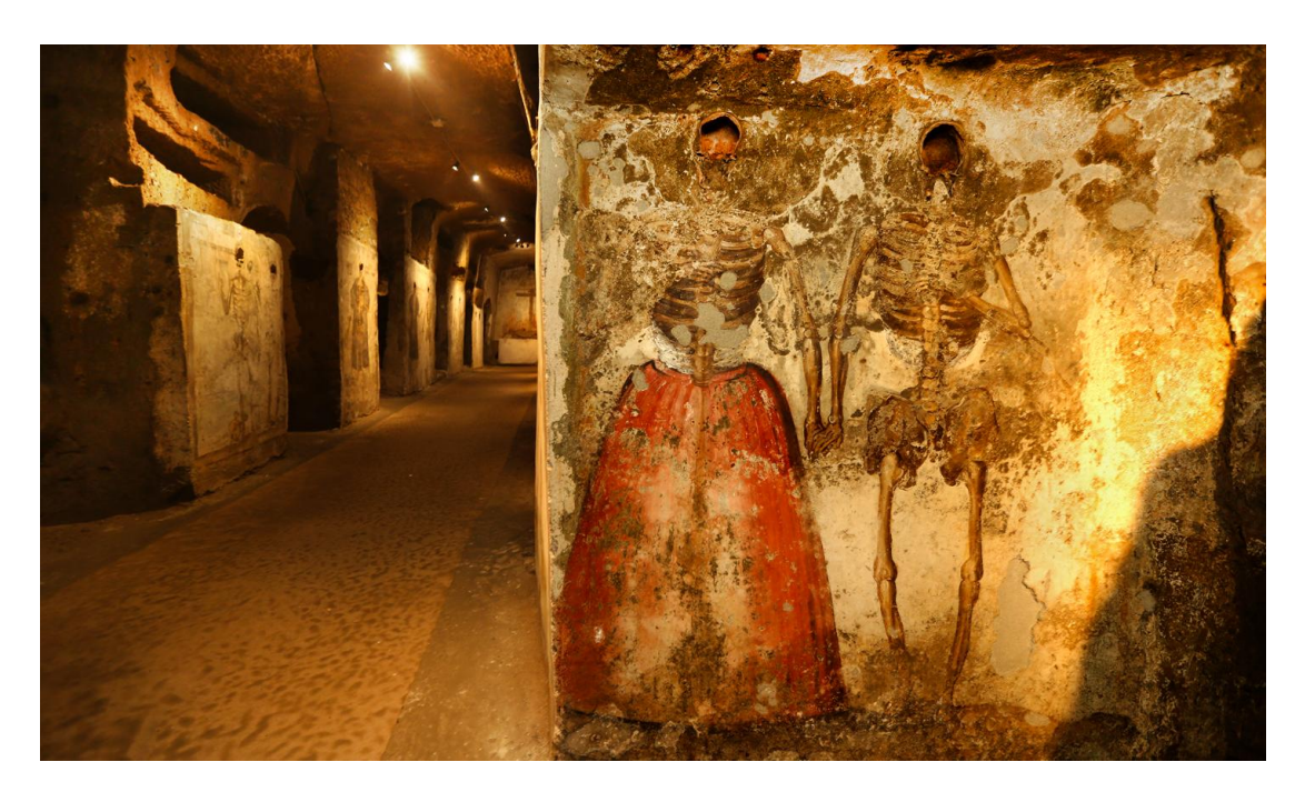
Ctacomba, Napoli, Italy