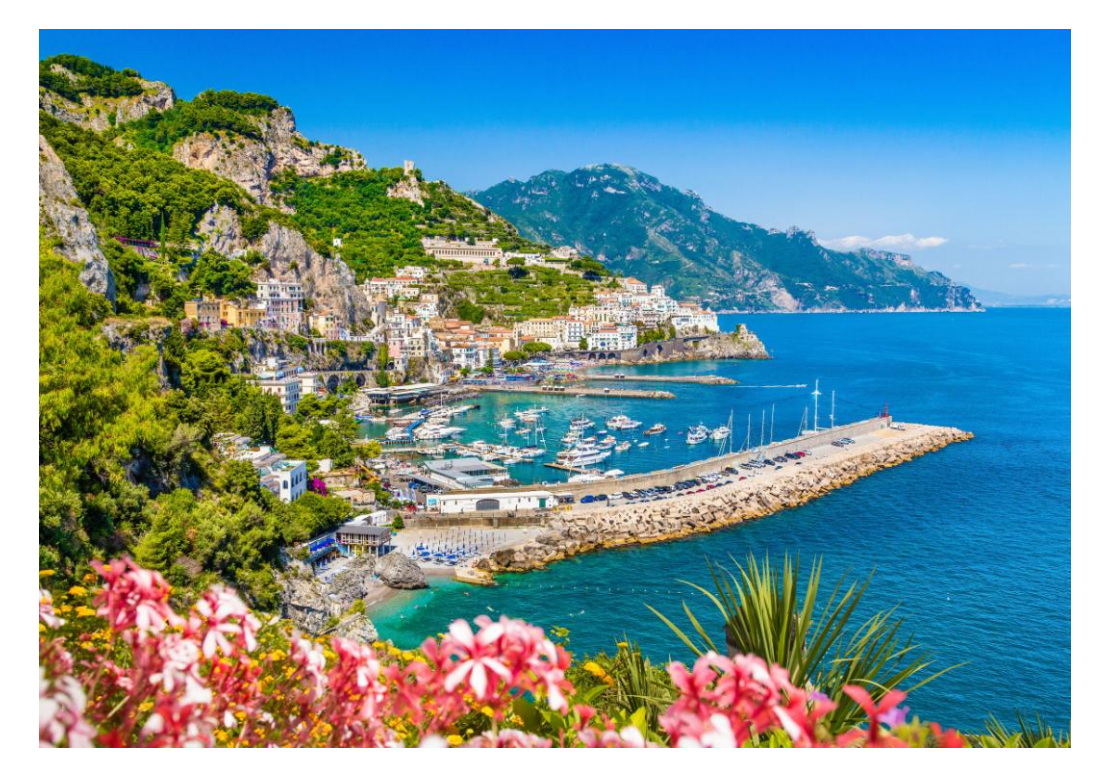
Amalfi Coast, Italy