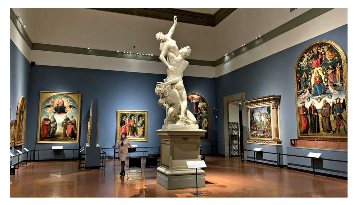
Accademia Gallery museum, Italy