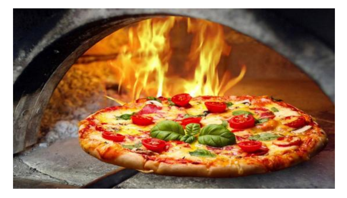
Pizza was born in Napoli, Experiencing best pizza in Naples