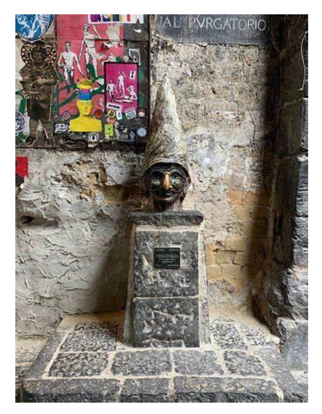
Pucinella, Naples, Italy