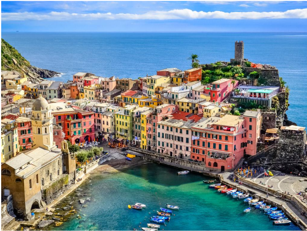
Cinque Terre, Italy