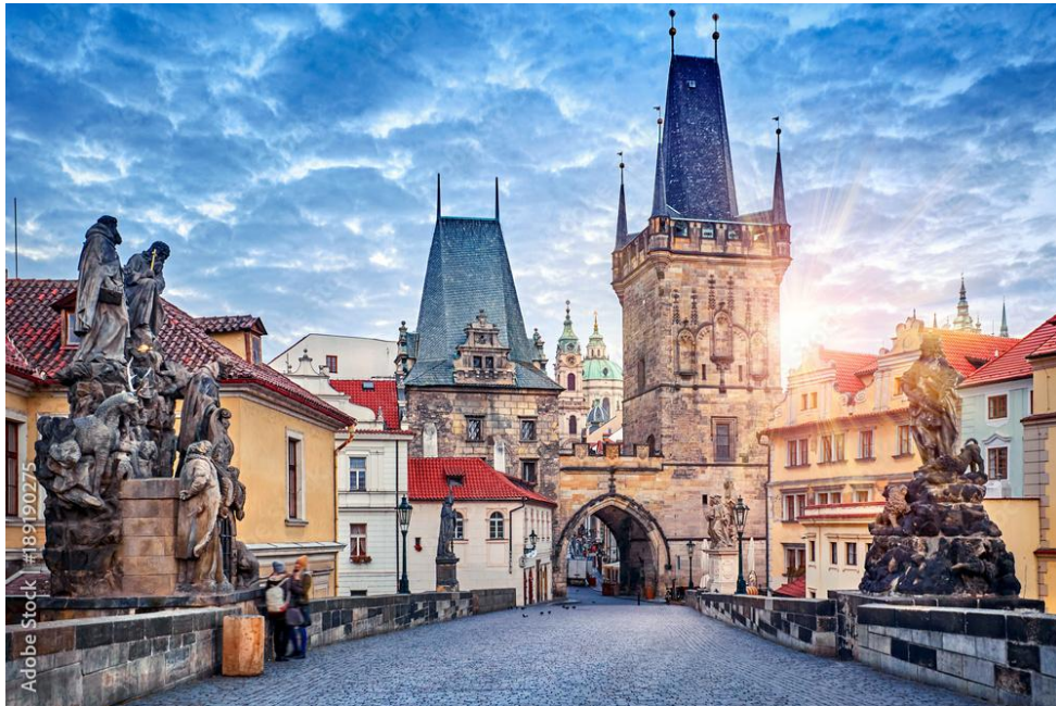
Charles Bridge, Prague