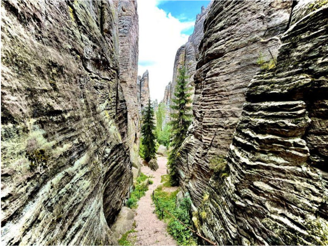
Bohemian Paradise, Czech