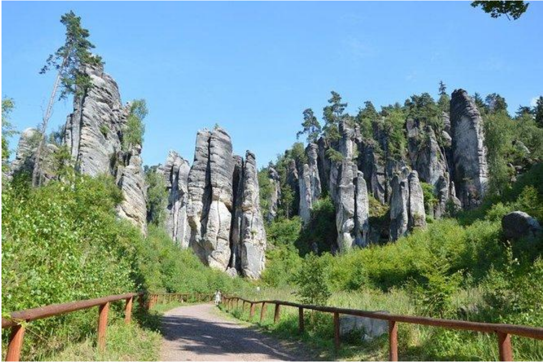
Bohemian Paradise, Czech