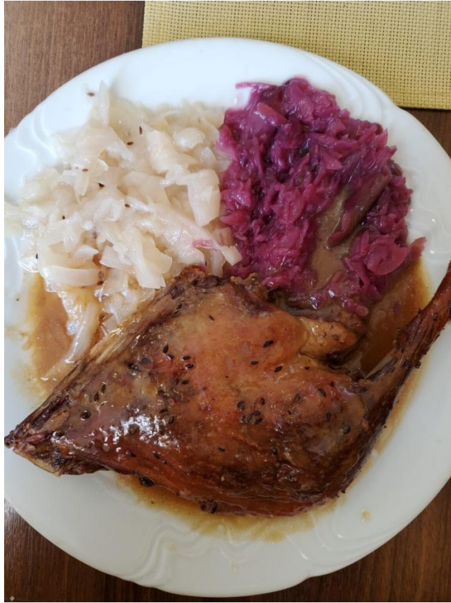
Czech Local food, Prague