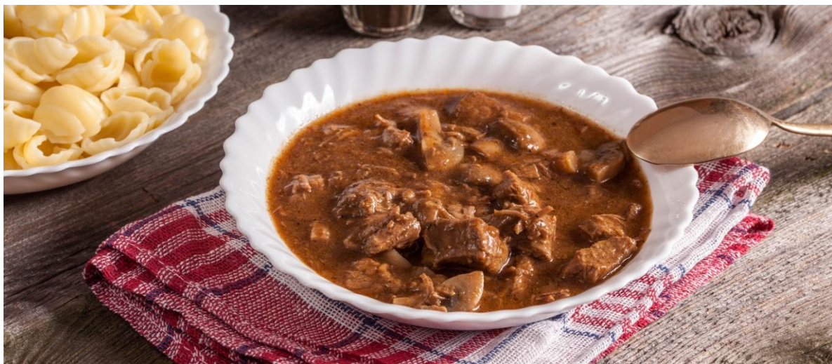
Wroclaw local food, Poland