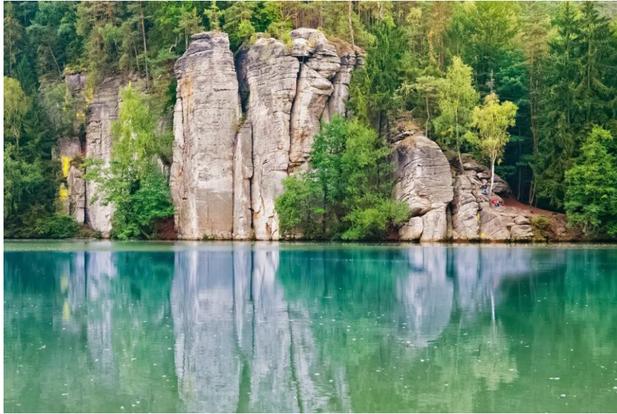
Bohemian Paradise, Czech