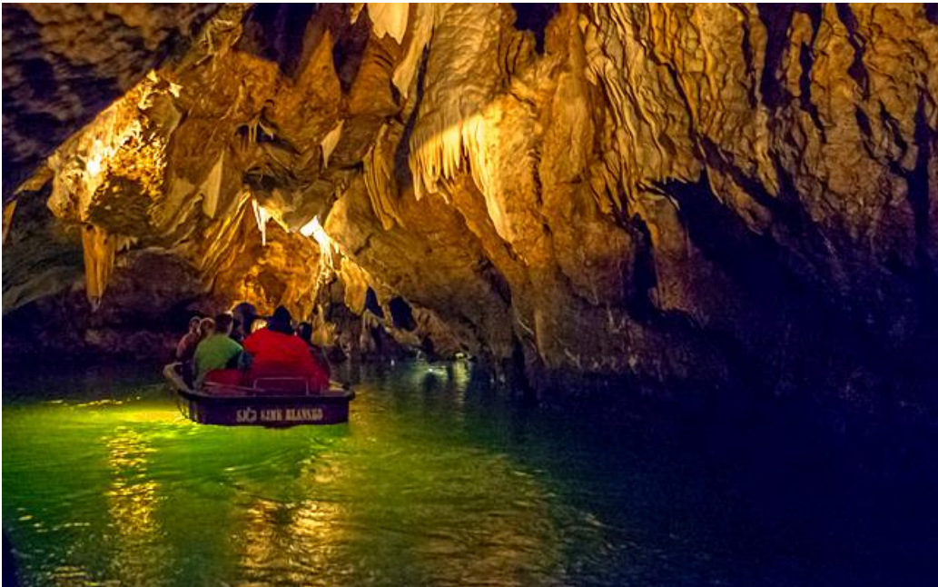
Moravian Karst, visiting inside caves