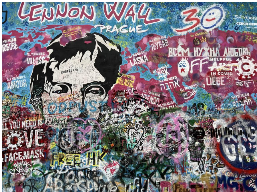
John Lennon Wall, Prague