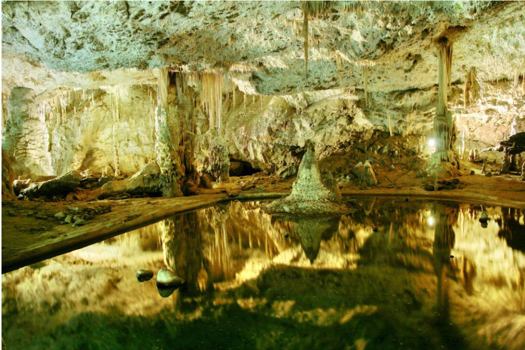
Moravian Karst, visiting inside caves