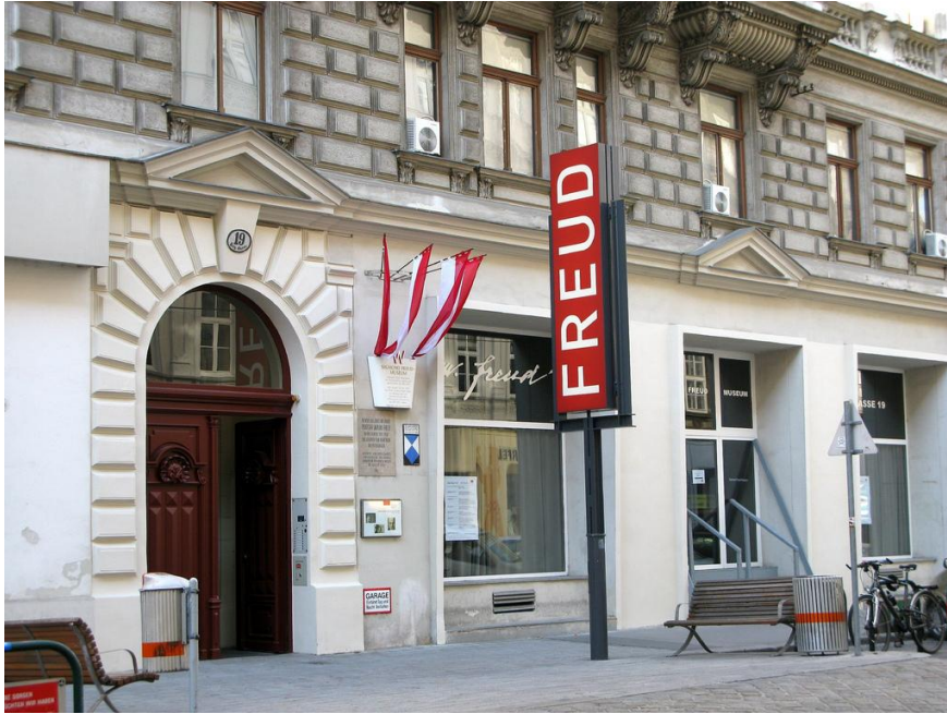
Sigmund Freud Museum, Vienna