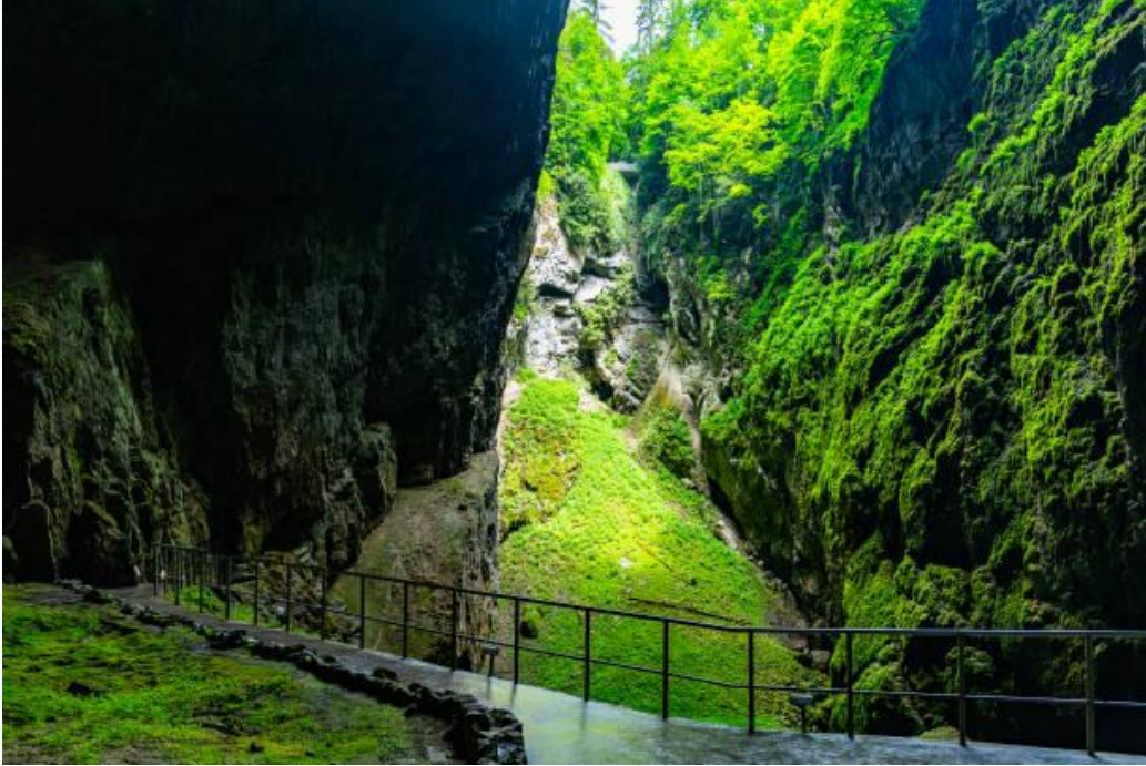
Moravian Karst, Brno, Czech