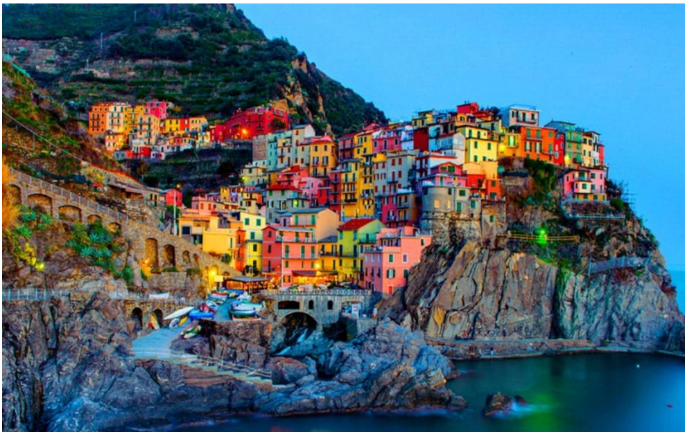
Cinque Terre, Italy