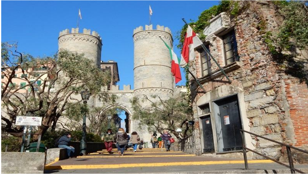
Christopher Columbus House, Genoa, Italy