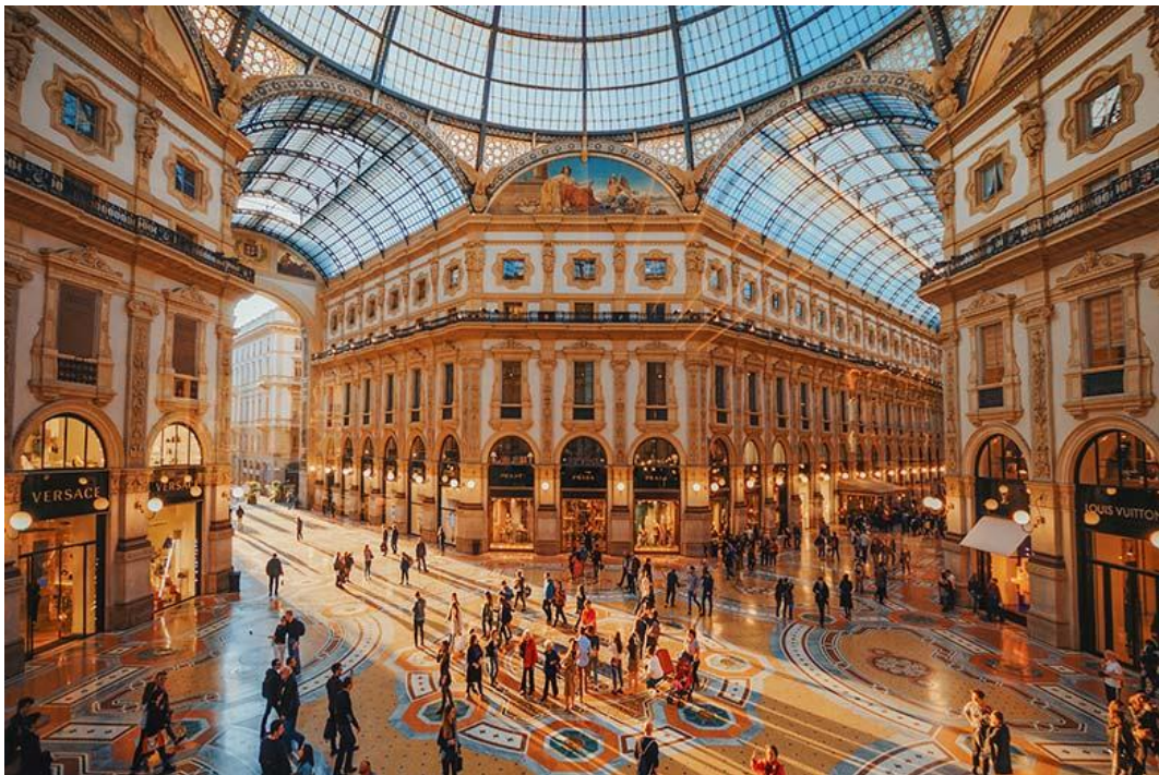
Vittoria Emanuele Cathedral, Italy