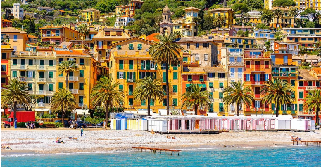
Santa Margherita Ligure, Italy