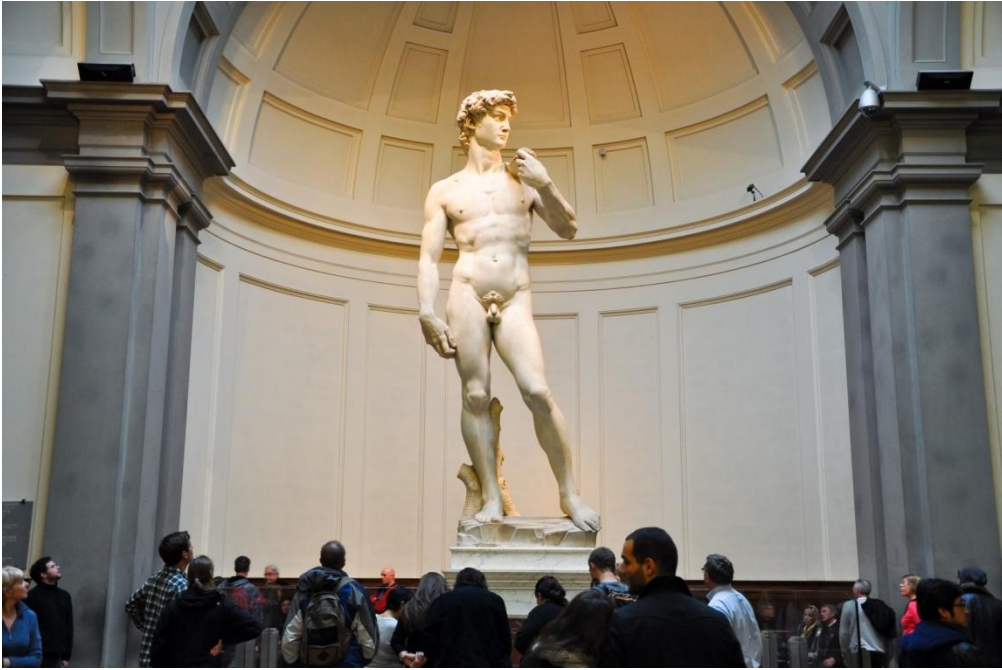
Accademia Gallery Museum, Florence