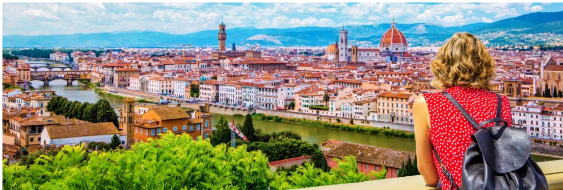
Michelangelo square, Florence, Italy