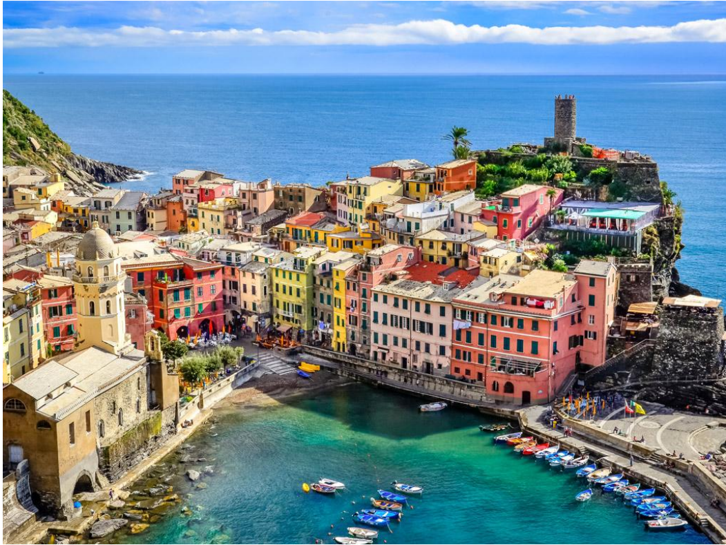
Cinque Terre, Italy