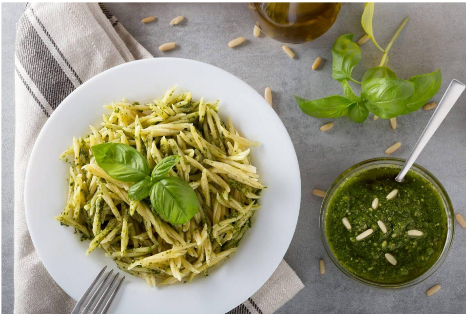
Local wine and food, Cinque Terre, Italy