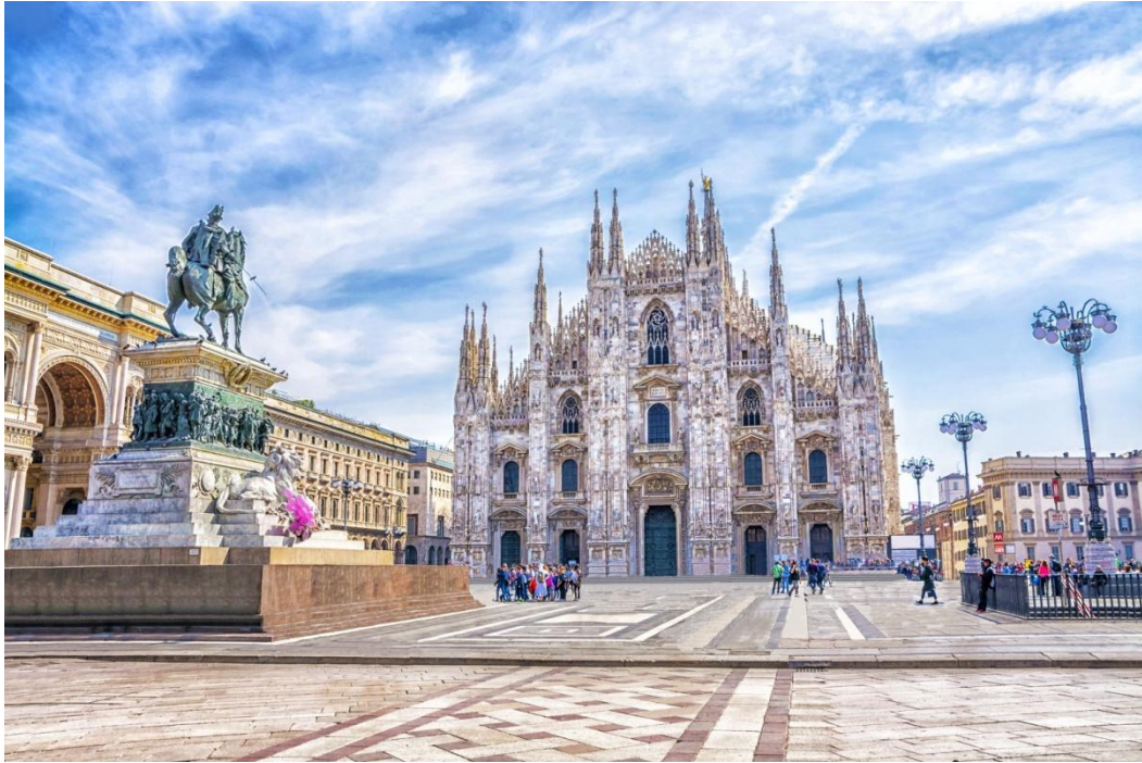
Milan, Duomo square, Italy