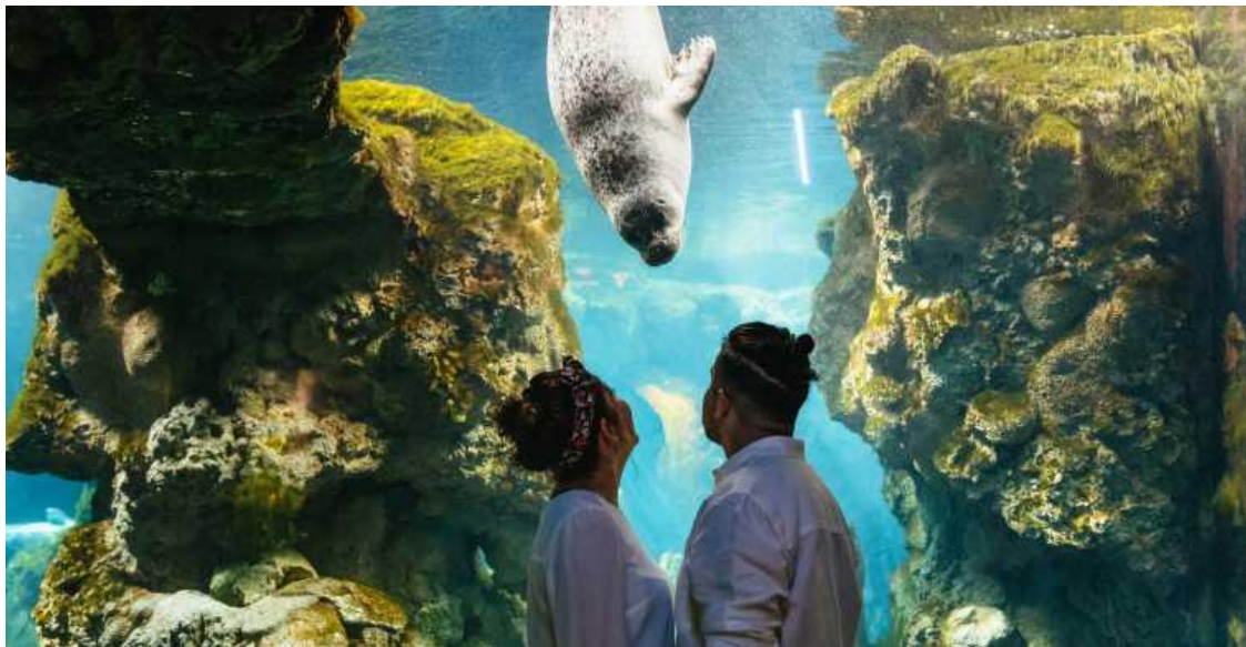
Genoa Aquarium, Italy