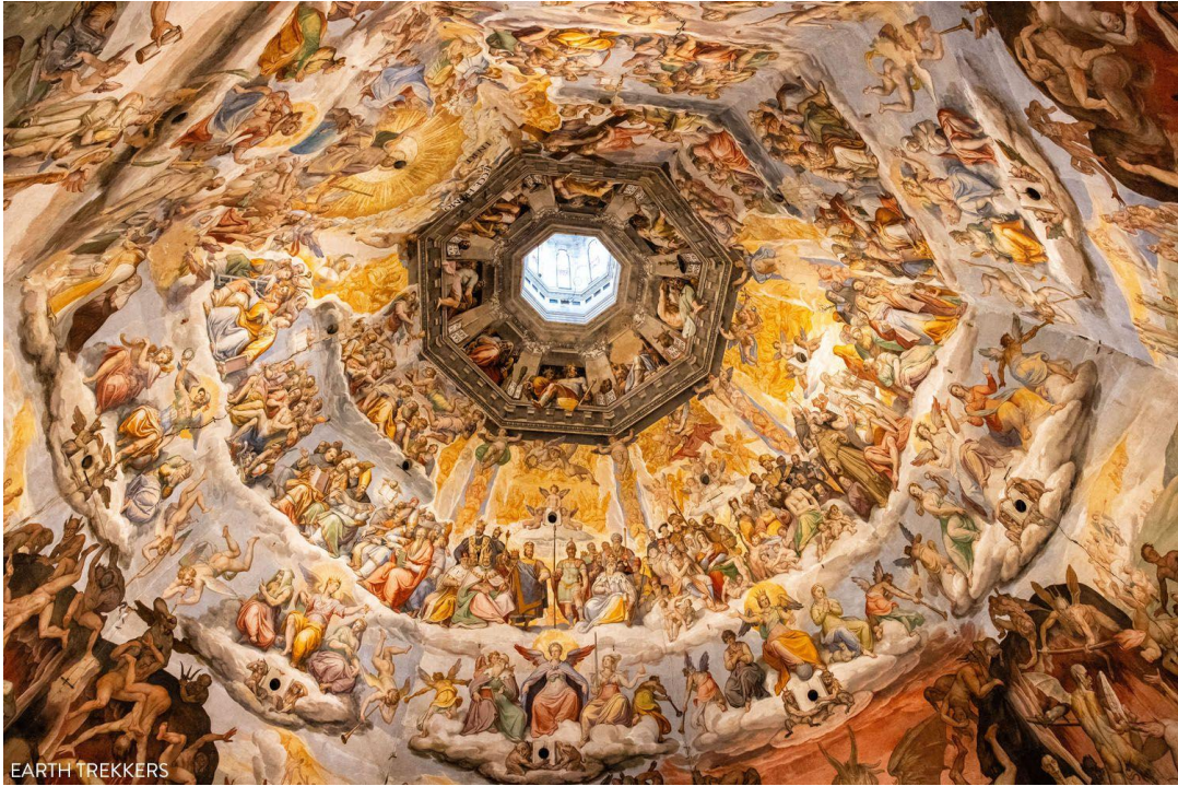
Florence Cathedral Dome