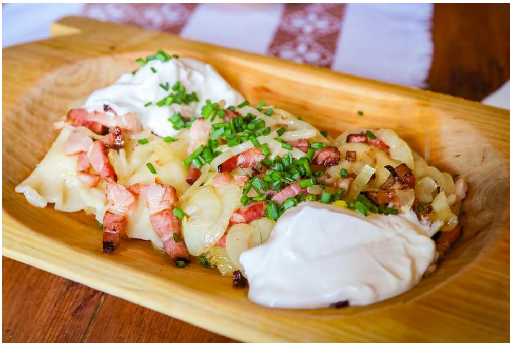
Slovakia local food, Kosice, Slovakia