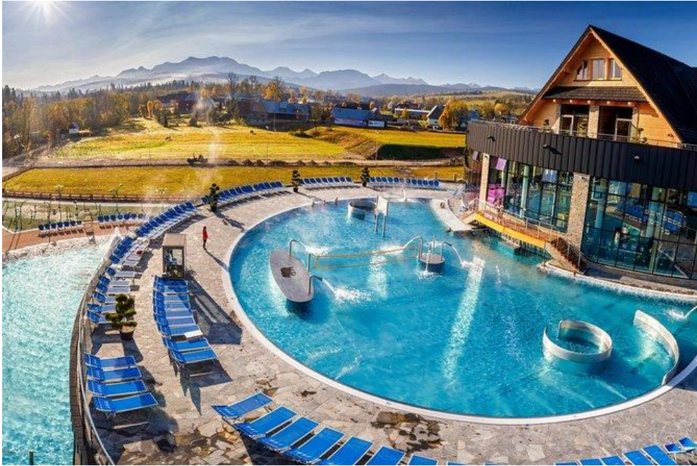
Zakopane Terme, Poland