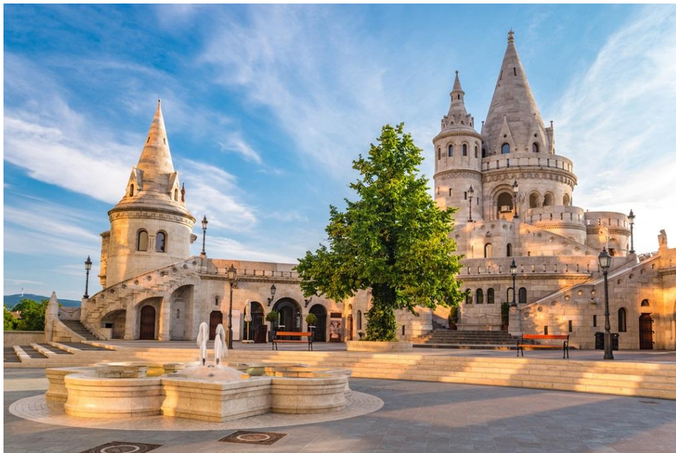
Budapest historical center