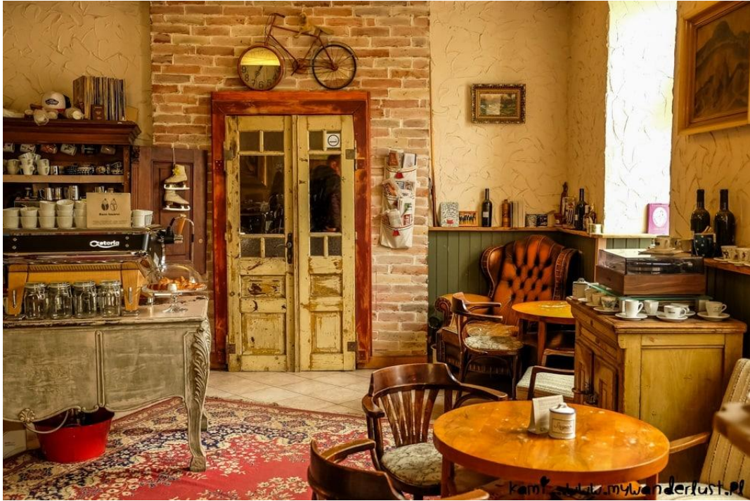
Experiencing local caffes in Kosice, Slovakia