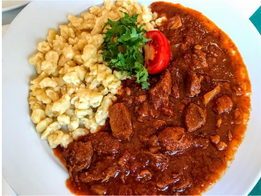
Experience Hungarian local cuisine, Budapest