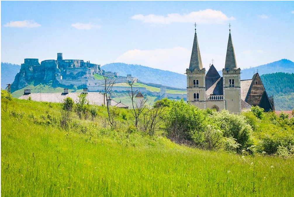
Spis Castle, Kosice, Slovakia