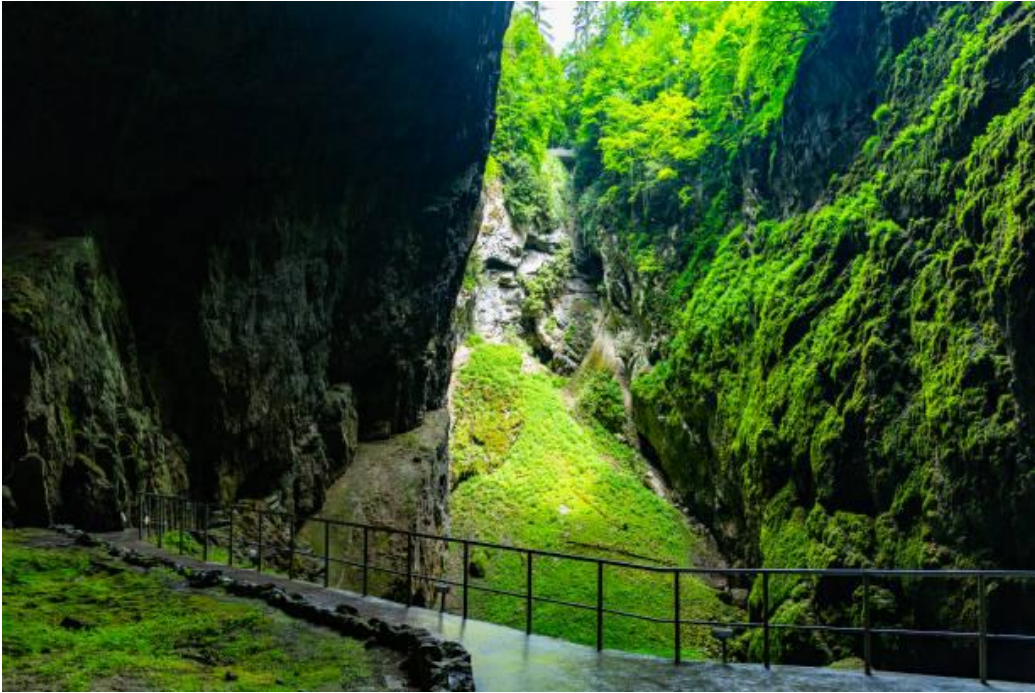
Moravian Karst, Brno, Czech