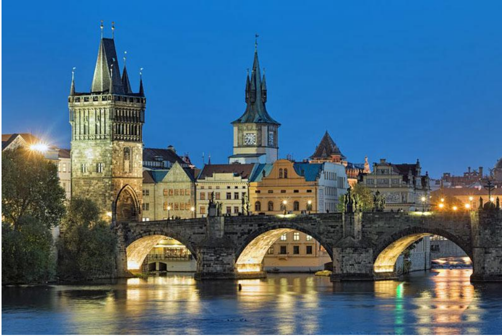
Charles Bridge, Prague