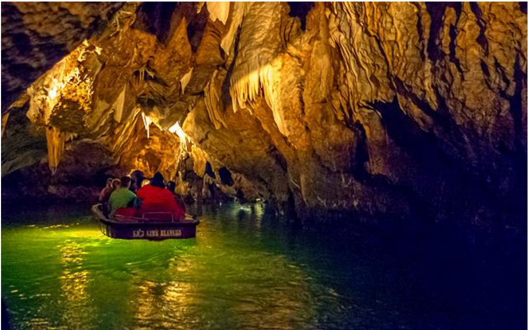
Moravian Karst, visiting inside caves