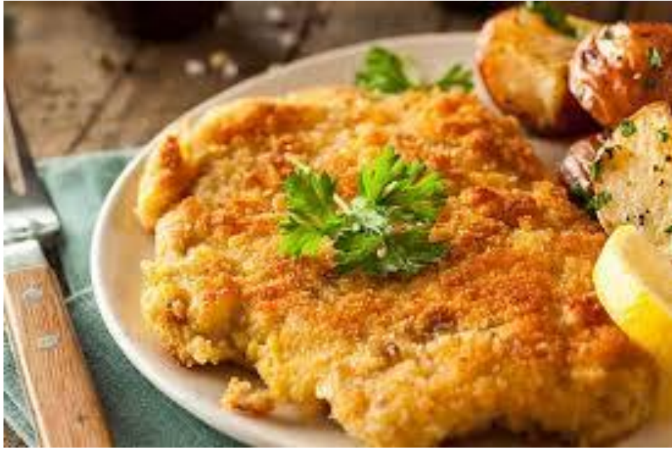
Experiencing local dishes, Vienna