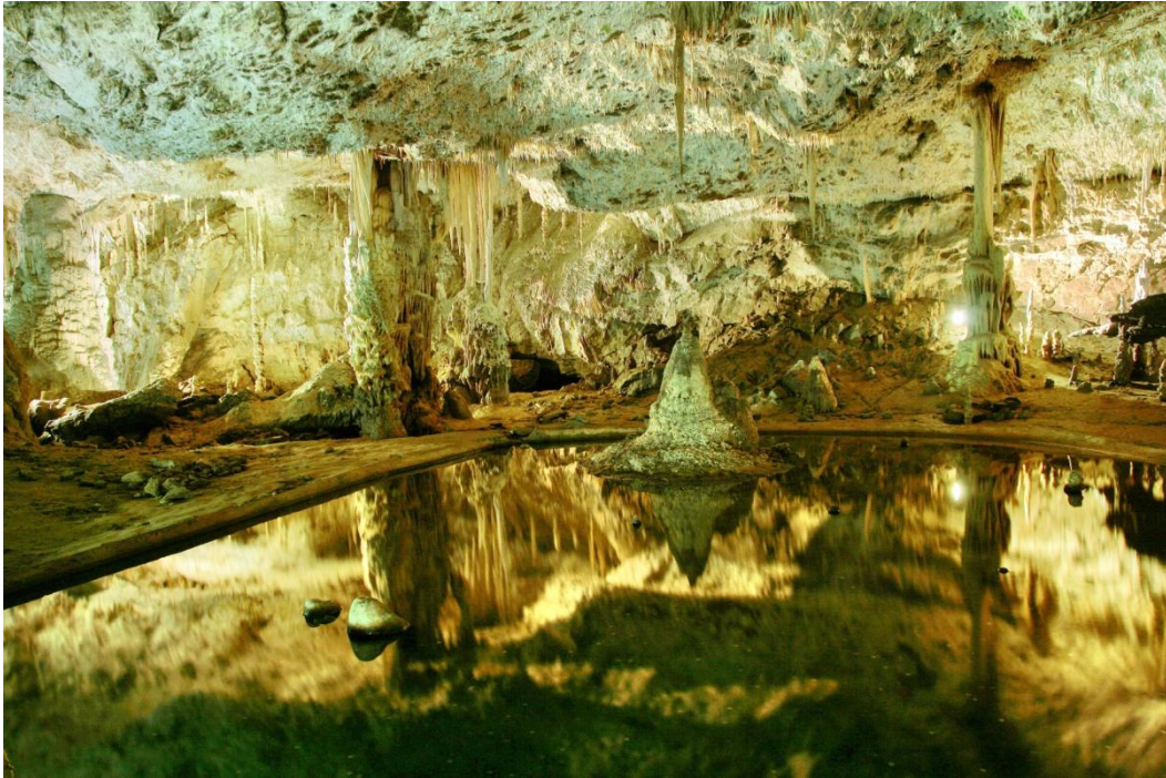
Moravian Karst, visiting inside caves