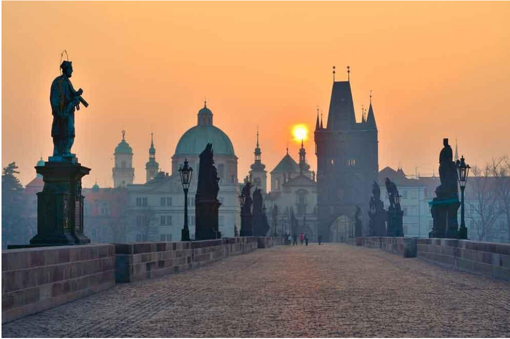
Charles Bridge, Prague