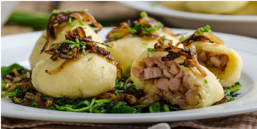
Experiencing local dishes, Czech